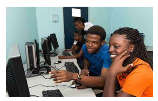
The My OC Student Portal

The MyOC Student Portal accessible at <a href="http://my.open.uwi.edu">http://my.open.uwi.edu</a> is the homepage for all Open Campus students. This portal provides access to course registration, the Learning Exchange where online academic activities take place, your academic record, general regulations and your email account. To access the MyOC Student Portal, log in using your Student ID number and the default password – that is, your date of birth in the YYYYMMDD format. You must change your password after logging in for the first time. Please check the calendar and announcements regularly. You have a responsibility to keep yourself informed about your academic programme and other campus issues.